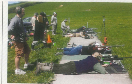
➤ Kiwi shooters around the country are getting in some practice, in anticipation of the international competition arriving.

“THE NEW ZEALAND PALMA TEAM HAS BEEN NAMED; 26 SHOOTERS, COACHES AND MANAGEMENT ARE NOW TRAINING TOWARDS A GOAL OF WINNING THE PALMA TROPHY IN 2019. SECOND IS THE BEST NEW ZEALAND HAS ACHIEVED SO FAR BUT WE ARE STILL COMPETITIVE...”