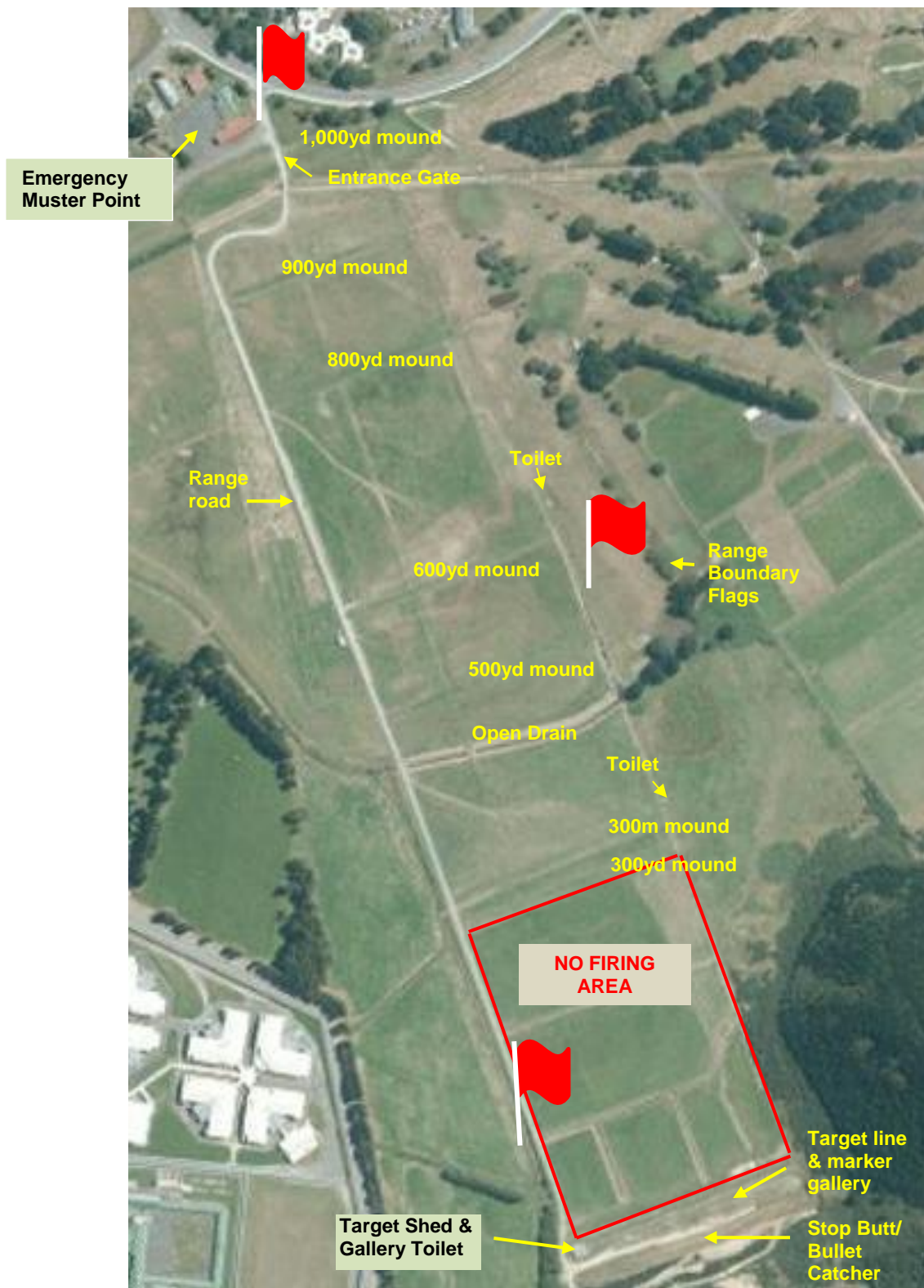
Aerial image depicting Seddon Range features