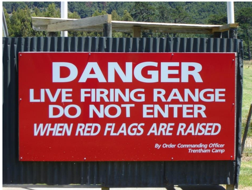
Range Danger Sign Used on Trentham Ranges

18. Range Safety Certificates. An NZDF Range Safety Certificate has been produced for NRANZ use of Seddon Range. The current safety certificate is located in one of the clear plastic envelopes on the green coloured Seddon Range sign adjacent to the NRANZ Headquarters.